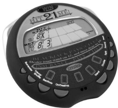
Model 74050 For 1 player / Ages 8 and up INSTRUCTION MANUAL P/N 82384000 Rev.A